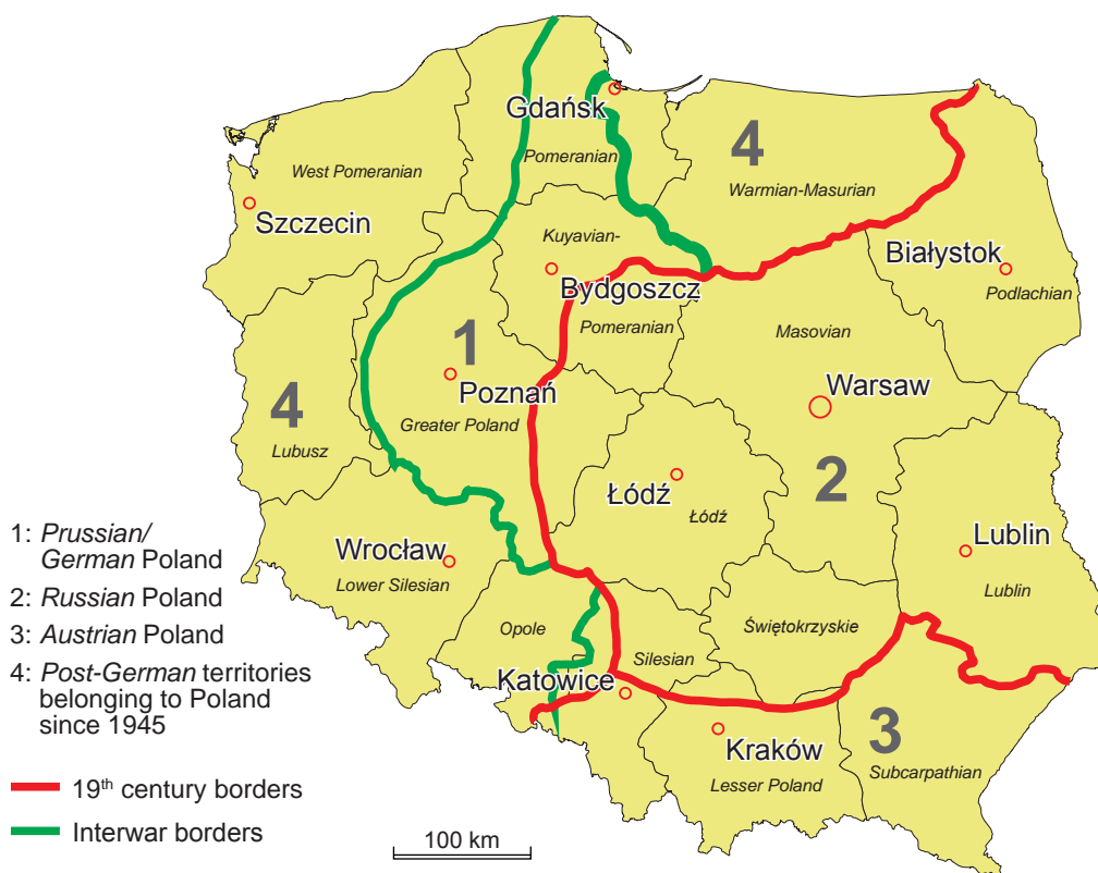
Fig. 1: Voivodeships of Poland and historical borders

ally opt for liberal/social democratic parties and candidates (so-called liberal Poland , in Polish Polska liberalna ), the central and eastern provinces are dominated by conservative voters (so called solidary Poland , in Polish Polska solidarna 2) ). The borders (usually very sharp) of the indicated splits (not) surprisingly correspond with the historical borders within the Polish state: the nineteenth century boundaries of Prussia/Germany, Russia and Austria (JANICKI et al. 2005). Additionally, post-German territories are also visible in this puzzle.