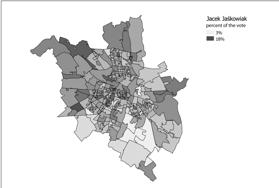
Figure 31.2 Spatial distribution of My-Poznaniacy support in 2010

the socialist middle class in the 1970s and 1980s. They were largely “unfinished utopias”, to borrow Katherine Lebow’s (2013) apt phrase – but in a more quotidian sense. The socialist state was notorious for building new apartments without the amenities. While for the high-rise estates these ‘shortages’ were about schools or retail stores, for low-rise areas the problems were even more dramatic. Although many of those areas had comprehensive plans, like in Poznań’s Strzeszyn (see Figure 31.3), most of the amenities, including electricity, sewerage or telephone, had to be self-built by the residents themselves. Thus especially during the crisis-ridden 1980s, many grassroots committees were formed – exactly like in Brazilian cities described by James Holston (2008). Many of them were active during the political festival of 1988–1991, and during the 1990s were formally registered as community boards ( rady osiedla ).