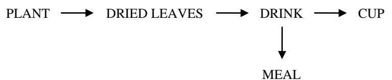
Figure 2. Metonymic chain for tea .

The study shows that in their representation of multiple metonymies, the examined dictionaries in most cases order the source sense before the target senses. The ordering of multiple targets, however, is not uniform when the five dictionaries are compared. Multiple metonymies also frequently appear as separate senses, which weakens the semantic relation. MEDAL2 is the only dictionary which nests subsenses on a regular basis. For a model arrangement of metonymic and metaphorical senses developing from the same source, MEDAL2’s entry for face provides an apposite example. The two metonyms appear as subsenses 1a and 1b nested under the source of the transfer, and are followed by metaphorical meanings. The entry follows the cognitive approach, as it indicates the close connection between the source of metonymy and the targets that stem from it.