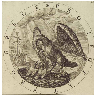
Fig. 3. Pro Lege et pro grege. Emblem from George Wither, A Collection of Emblems (1635: 154); adopted from Gabriel Rollenhagen, Nucleus emblemata (Arnheim, 1611), Emblem 134.

Another important proposition of Russell's explains the special process of reading which early modern users applied to interpreting emblems. He calls this “scanning,” suggesting that the emblem pictures were not perceived in their entirety as a unified vision, rather the users scanned them, building up the meaning step by step. He relates this to “oral imagination”, also studied by Marshal McLuhan and Walter J. Ong, by which following a linear procedure the viewer would use variable strategies to create connections among the elements, usually between two at a time (Russell 1988: 82). According to Russell we should call this technique “quasi-literacy” and the structure of a picture produced by it resembles the structure of dialogues or orally presented riddles. Consequently, “if we moderns find some other way of viewing the picture more “natural” or compelling, and feel obliged to take account of these traits, there is no good reason to suppose that contemporaries did so, too” (Russell 1988: 82).