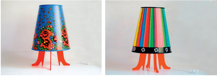
SHE! Lamp by Katarzyna Herman-Janiec

the exceptionality of this action. This hiding place is also meant to gain the name of the most precious in the whole chamber”. 15 This modern project restores to an interior one of the most characteristic folk pieces of furniture at one time. It is important from the point of view of its function (storing) and also an essential element of social culture (dowry chests). Roman Reinfuss explains – “Painted chest was formerly an object of ardent desire of every adolescent girl” (Reinfuss, 1954, p. 5).