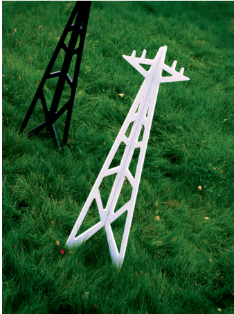
TENSE coat hanger by AZE Design

changes visible in rural landscape, is “TENSE coat hanger.” Made of light materials, it has a characteristic, simple form and makes an icon of contemporary design in the trend of ethno-design. The designers themselves say: “Pylons in natural and urban landscape were the inspiration to this project. Their geometrical form subordinated only to the function of ‘tensing’ electric wires has now found a completely new application”. 12 Just as the introduction of electricity was the evidence of changes in the rural landscape, so in the field of Polish (and not only Polish) design, this project has become the determinant of new ways of thinking about tradition and changes in the countryside.