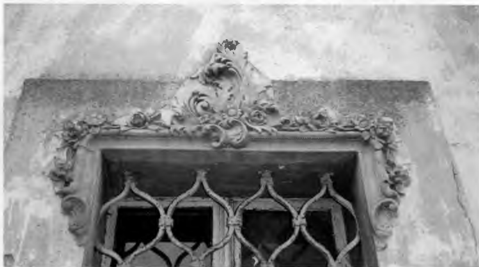
11. The Gaj Mały estate from the west, showing the gallery's building altered entrance, photograph by the author (2003)

to medieval town gates or to Gothic fortified churches. Furthermore, there is a number of differently shaped roofs and even combinations of the most divergent construction techniques. The palace has a large wooden staircase while the small tower next to the gallery contains an iron spiral staircase of the latest fashion. It can be taken for granted that Raczyński cooperated closely with the architect and gave very precise instructions. The use of neo-Rococo elements, for instance, is surprising, for the phenomenon of neo-Rococo in Poland started not until the 1890s. 132 Possibly, Raczyński had the architect revert to this style because it was during the Rococo period that the family acquired Gaj Mały. Thus, the use of styles was not to define the age of the building but the period of time of the Raczyński family owning it. With the ensemble, Raczyński wanted to attain a picturesque silhouette suggesting organic growth over time. This also explains why the building has multiple axes. Regarding the integration of a gate tower and the number of differently shaped roofs' cupolas, Raczyński's idea possibly was to create the ideal Vedute of a European town.