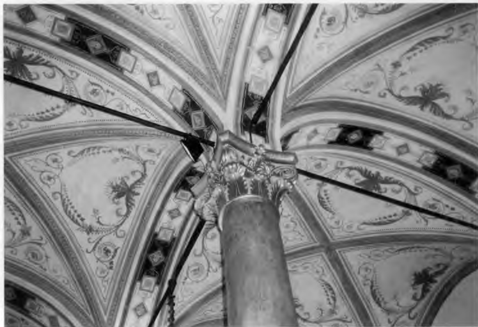
13. Ceiling of the gallery building in Gaj Mały, photograph by the author (2002)

Two massive grey marble columns crowned by gilded bronze capitals support the ceiling, which is stencilled with Pompeian motifs: tendrils and masks. [ill. 13] Although a decoration with Pompeian motifs in itself was nothing exceptional, this choice of style is anything but accidental. It alludes to Raczyński's view on Italy as the cradle of the very best art and as a country where famous noble families had also created extravagant family galleries. Moreover, the marble columns and the Pompeian decoration parallel the 'Antique' effect of the sculptures on the exterior; they convey the elevated air of an art museum to the simply structured room.