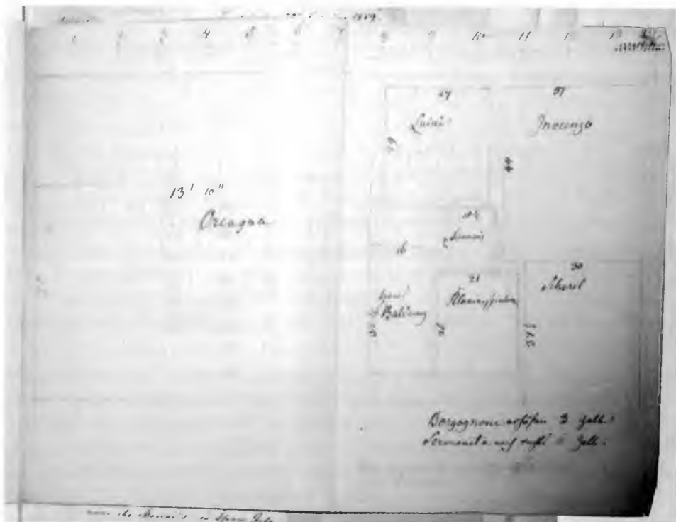
7. Athanazy Raczyński, Sketch of part of a gallery wall in the Palais (1863), in Libri Veritatis , Archive of the National Museum Poznań

favourable light, according to contemporaries. 106 As a photograph of 1852 indicates, top lighting had been planned from the beginning. [ill. 6] In that respect Raczyński's gallery surpassed the Royal Picture Gallery, which had been frequently criticised for its deficient lighting.