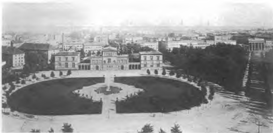
5. Palais Raczyński after its enlargement, (1881), photograph, 35,5 × 27 cm, Berlin, in Michael S. Cullen, Vom Exercierplatz zum Platz der Republik , ex.cat, Landesarchiv Berlin 1992, ill. III/10

The gallery was open to the public daily between 12 am and 2 pm; 98 admission cost 7½ Silbergroschen , which included a copy of the catalogue. 99 By comparison, the royal museum, also open daily, was free of charge, except on Tuesdays and on Wednesdays when it was reserved for artists. 100 Many private galleries were accessible exclusively by appointment, and often only displayed parts of the collections. 101