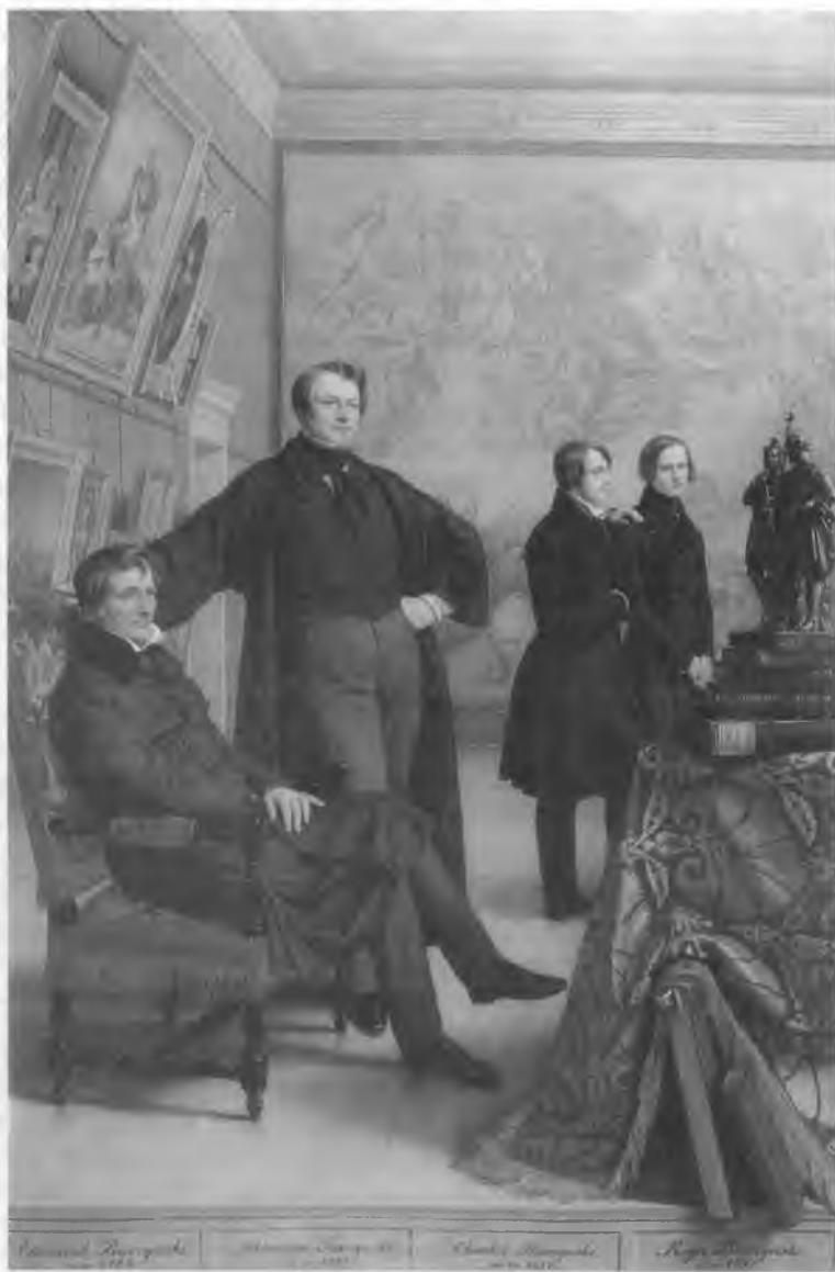
2. Carl Adolph Henning, Portrait of the Raczyński-family , (1839), oil/ canvas, 308 x 200 cm, National Museum Poznań

painted by Adolph Henning in 1839 indicates Athanazy's self-understanding in the cultural field.