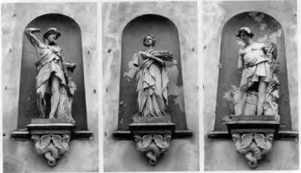
12. Sculptures on the gallery building in Gaj Mały (2003)

The gallery building stands at a right angle to the palace. With the rectangular base and only one storey the building has a simple structure. [ill. 11] It has a tilted roof with three dormers above a wooden freeze on each of its longitudinal sides. On the south wall we find the only two windows of the gallery. Above them the family's arms are integrated in the facade. The arched windows are decorated with neo-Rococo elements, thus creating an architectural relation to the palace.