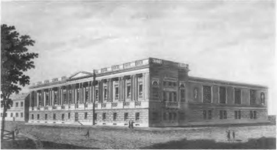
1. Library and Gallery Raczyński in Poznań around 1830, in Wspomnienia Wielkopolskie III, 1843

Friedrich Schinkel, was completed in 1829. 54 Unlike the library, it does not exist any longer. Slightly lower than the library, the gallery wing was an elongated building on a rectangular ground with a regularly structured facade and a hidden roof. Two exhibition rooms with high ceilings were situated above a rusticated ground floor. 55 On the gallery floor, there were four large windows flanked by sculptures in niches.