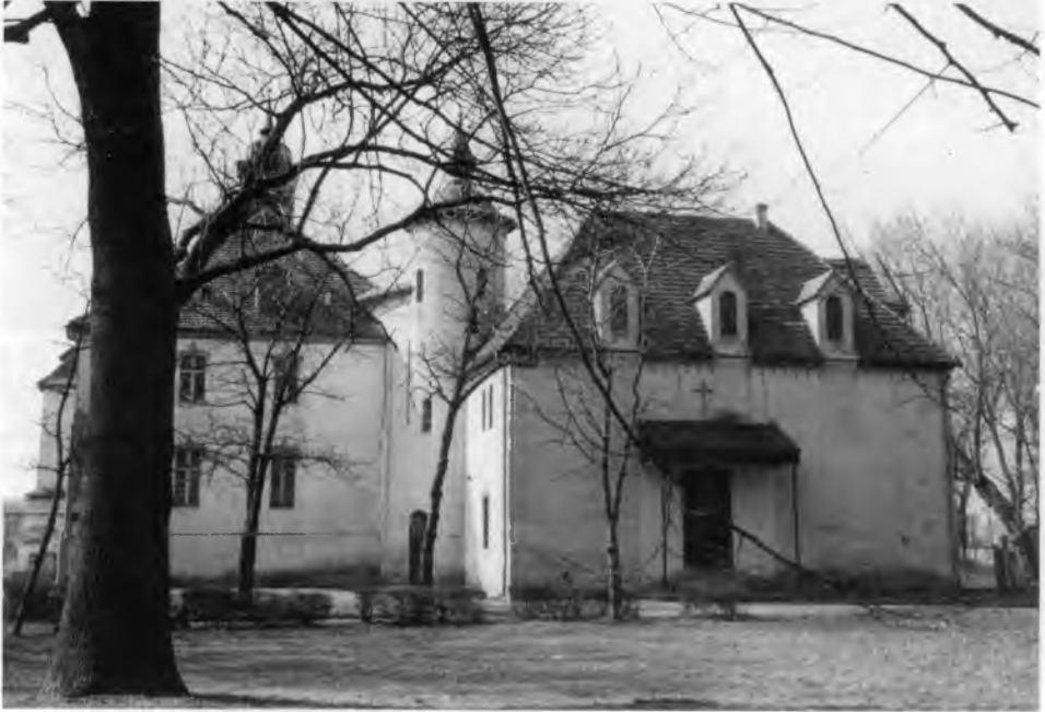
10. Gaj Mały, ground-floor window of the palace with neo-Rococo decoration in terracotta, photograph by the author (2003)

covered with slate tiles. The facade of both the north and the south side is structured by two small arched windows on each storey. Moreover, the Southern wall is decorated by a sculpture placed between the two first floor windows. This is a terracotta copy of an antique, namely the 'Reposing Satyr' of the Halbrondell – a great semicircle constituting the garden-side of the Neues Palais in Potsdam. 131 The gate tower could be entered from both sides through doors of the same shape as the arched doorway. Apart from the gate tower Athanazy added two further towers. Both of them have a circular ground while their cupolas are shaped differently.