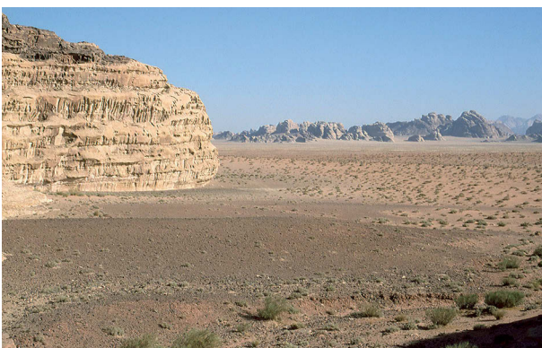
Fig. 3. Depositional ramps around inselbergs built of the Umm 'Ishrin Sandstone

A typical Umm 'Ishrin Sandstone slope (Fig. 2a) consists of a case hardened red cliff towering above its base by a few tens to a few hundreds of meters, which usually terminates at a distinct piedmont angle, although a rock-cut ramp inclined by 30–40° is occasionally present. The rock slope in its lower segment may be hidden beneath talus which extends from the cliff away towards the adjacent plain, or locally by climbing dunes. If talus and aeolian sand are absent, overhangs are frequently observed and some attain enormous dimensions, of 50 m across, 10–15 m deep and up to 10 m high. Overhangs (bedding caves) are also frequent along bedding planes higher up within the cliffs. Available evidence shows that gently sloping or even flat surfaces at the base of the cliffs are of depositional rather than erosional origin (Fig. 3). These ramps evolve from rock-fall derived talus, through its further disintegration