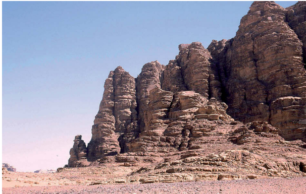
Fig. 2a. Example of sandstone rock slopes in south-west Jordan: angular rock slopes in the Umm 'Ishrin sandstone, the northern sector of Wadi Rum area

The differences between typical slope forms developed in the Umm 'Ishrin, Disi, and Umm Sahm Sandstones become obvious even to the casual observer. The Umm 'Ishrin landscape is dominated by vertical rock slopes, towers and spires with vertical walls, locally benched (Fig. 2a), whilst the Disi usually produces rounded forms of bell-shaped hills, domes or low whale-backs (Fig. 2c). Young et al. (2009) distinguish between two fundamental slope forms within sandstone relief, vertical cliffs and curved slopes respectively, and this is exactly what occurs in the study area. A further difference results from the intensity of cavernous weathering present on rock slopes within each unit. It is ubiquitous within the Umm 'Ishrin Sandstone, hence deep niches and networks of tafoni are very common and the slopes resemble giant honeycombs (Fig. 2b) (Abu-Safat 1987, Goudie et al. 2002). Within the Disi sandstones, cavernous weathering is much more restricted and larger caverns are few