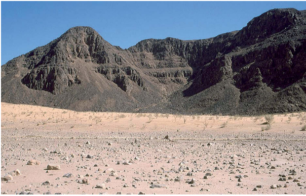
Fig. 2e. Example of sandstone rock slopes in south-west Jordan: rock and debris slope in the Umm Sahm sandstone, east of town of Diseh

stability is insufficient to allow for the growth of caverns inside the rock faces.