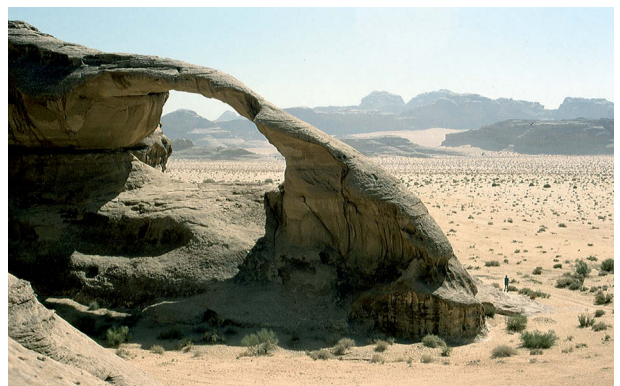
Fig. 2d. Example of sandstone rock slopes in south-west Jordan: one of the rock arches in the Jebel Al Kharaz massif built of the Disi sandstone

and far apart. Instead, the curved slopes of the Disi have smooth surfaces and mid-slope benches are rare. A notable feature observed within the Disi Sandstone are natural rock arches, among which those at Jebel Al Kharaz east of Al-Quwayra are particularly impressive (Fig. 2d). Altogether, around ten examples are known in the area, and the spans of the largest of them exceed 25 m, with the height up to 10–15 m (and 35 m in the extreme example of Burdah rock bridge) (Debossens 2000). Slopes developed in the Umm Sahm Sandstone have a different appearance and lack in long sections of vertical cliffs. Instead, they consist of a moderately inclined (40–60°), dissected rock slope above and a long debris slope at the angle of repose below (Fig. 2e). Cavernous weathering is largely absent, apparently because of the uniformity of the rock and dense jointing which contributes to efficient rock breakdown and high detachment rate. Hence, surface