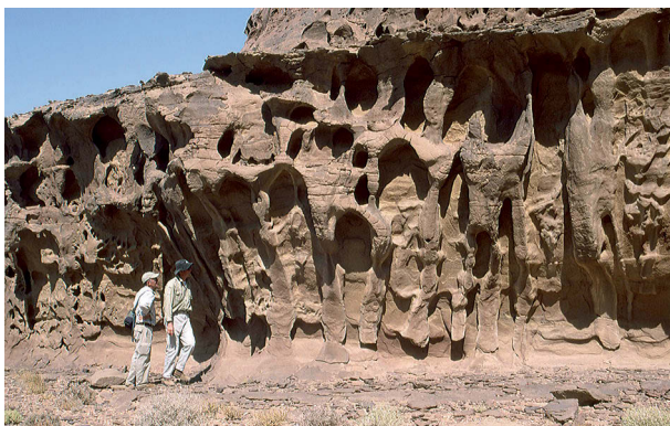
Fig. 2b. Example of sandstone rock slopes in south-west Jordan: extensive cavernous weathering within the Umm 'Ishrin sandstone

The differences between typical slope forms developed in the Umm 'Ishrin, Disi, and Umm Sahm Sandstones become obvious even to the casual observer. The Umm 'Ishrin landscape is dominated by vertical rock slopes, towers and spires with vertical walls, locally benched (Fig. 2a), whilst the Disi usually produces rounded forms of bell-shaped hills, domes or low whale-backs (Fig. 2c). Young et al. (2009) distinguish between two fundamental slope forms within sandstone relief, vertical cliffs and curved slopes respectively, and this is exactly what occurs in the study area. A further difference results from the intensity of cavernous weathering present on rock slopes within each unit. It is ubiquitous within the Umm 'Ishrin Sandstone, hence deep niches and networks of tafoni are very common and the slopes resemble giant honeycombs (Fig. 2b) (Abu-Safat 1987, Goudie et al. 2002). Within the Disi sandstones, cavernous weathering is much more restricted and larger caverns are few