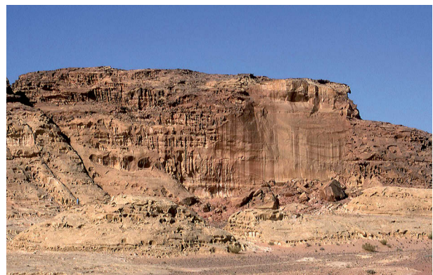
Fig. 5. Massive rock slope failure within the Umm 'Ishrin Sandstone. Note the smooth surface of the exposed failure plane, with no cavernous weathering present

ern shoulder of the Dead Sea rift), but at present there is no solid supporting evidence. Debris accumulation due to slope failure occurs either away from the rock face or buries the slope/pied-