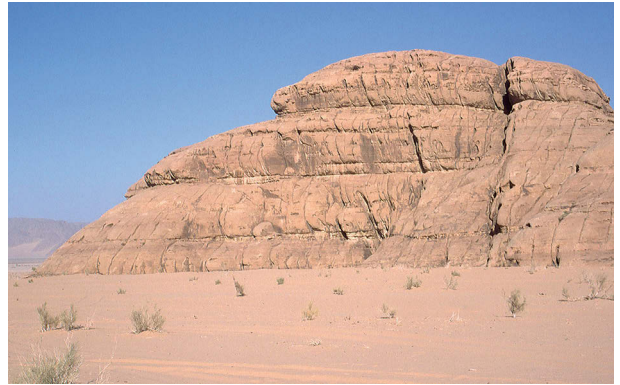
Fig. 2c. Example of sandstone rock slopes in south-west Jordan: rounded slopes of an inselberg built of the Disi sandstone, near Diseh

and far apart. Instead, the curved slopes of the Disi have smooth surfaces and mid-slope benches are rare. A notable feature observed within the Disi Sandstone are natural rock arches, among which those at Jebel Al Kharaz east of Al-Quwayra are particularly impressive (Fig. 2d). Altogether, around ten examples are known in the area, and the spans of the largest of them exceed 25 m, with the height up to 10–15 m (and 35 m in the extreme example of Burdah rock bridge) (Debossens 2000). Slopes developed in the Umm Sahm Sandstone have a different appearance and lack in long sections of vertical cliffs. Instead, they consist of a moderately inclined (40–60°), dissected rock slope above and a long debris slope at the angle of repose below (Fig. 2e). Cavernous weathering is largely absent, apparently because of the uniformity of the rock and dense jointing which contributes to efficient rock breakdown and high detachment rate. Hence, surface