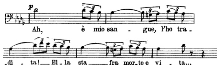
Example 2. G. Donizetti, Lucia di Lammermoor , Act II, the original second theme of the sextet

After a descending passage, the first main subject of the sextet section in D-flat major is presented, after a double exposition; Liszt developed the cadence based on the rapid course of thirty-second notes, and then introduced the second theme in A-flat major, in a rhythm slightly contrasted with the preceding \frac{3}{4} :