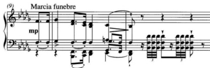
Example 4. Liszt, Marche funèbre et Cavatine de la 'Lucia di Lammermoor' , the march motif