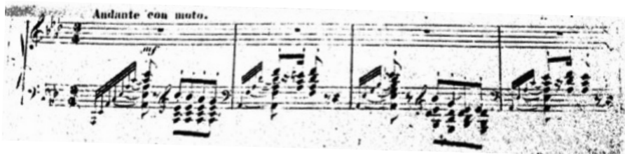
Example 9. F. Liszt, Réminiscences de 'Lucrezia Borgia' – Grande fantasia I , the second motif, Gennaro's invitation

The second motif developed from Grande fantasia I is Gennaro's invitation: 22