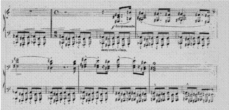
Example 11. F. Liszt, Réminiscences de 'Lucrezia Borgia' – Grande fantasia II , the theme of the finale of the Prologue , Maŕio Orsini signora son io