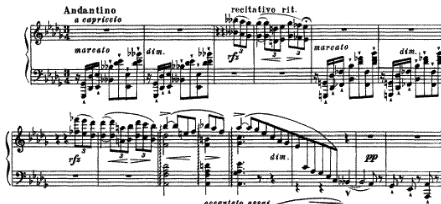
Example 1. F. Liszt, Réminiscences de 'Lucia di Lammermoor' , the introduction

After a descending passage, the first main subject of the sextet section in D-flat major is presented, after a double exposition; Liszt developed the cadence based on the rapid course of thirty-second notes, and then introduced the second theme in A-flat major, in a rhythm slightly contrasted with the preceding \frac{3}{4} :